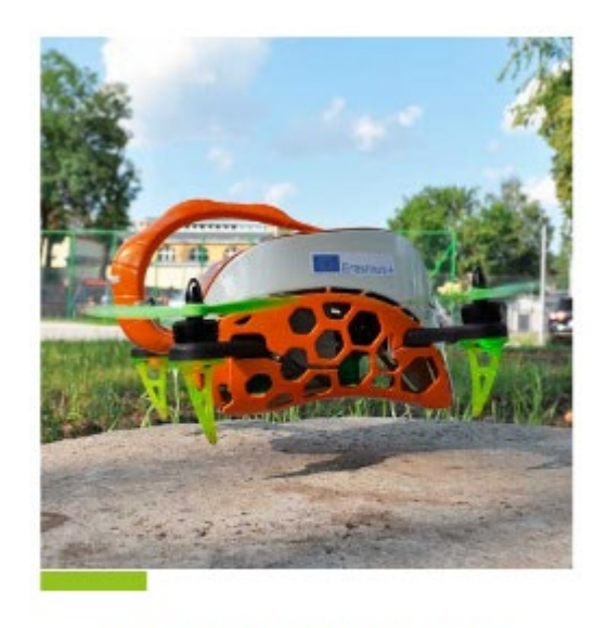
Advanced Drone Assembly

Assembling GPS, Barometer, Telemetry, First Person View, etc.