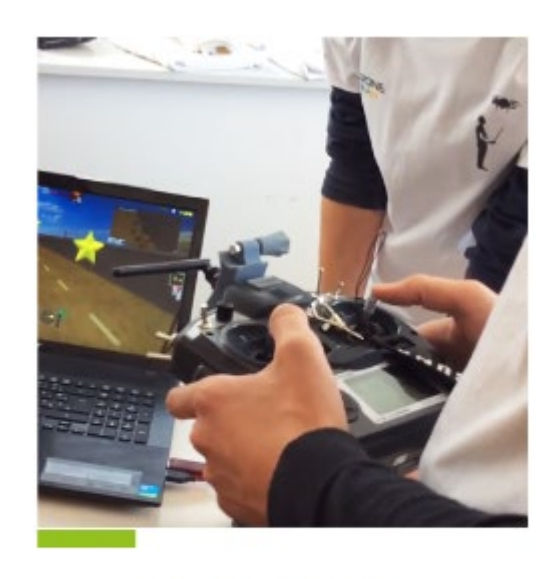
How to Fly a Drone

Learn all about configuration and how to use Mission Planner